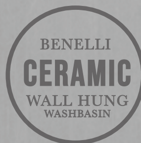
RIGHT HAND BOWL BEN-5040R